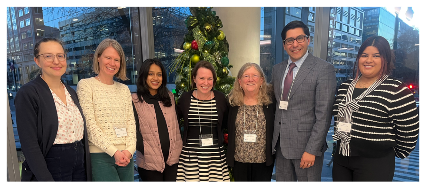
The American Immigration Council litigation team at this year's litigation convening.

We continue to litigate this case in the Eighth Circuit Court of Appeals, which is essential to discourage future copycat laws. Through this litigation, we have shown Iowa and other states considering enacting similar laws that they will face strong opposition and will need to overcome serious litigation challenges if they attempt to usurp federal immigration enforcement authority in order to target their own residents.