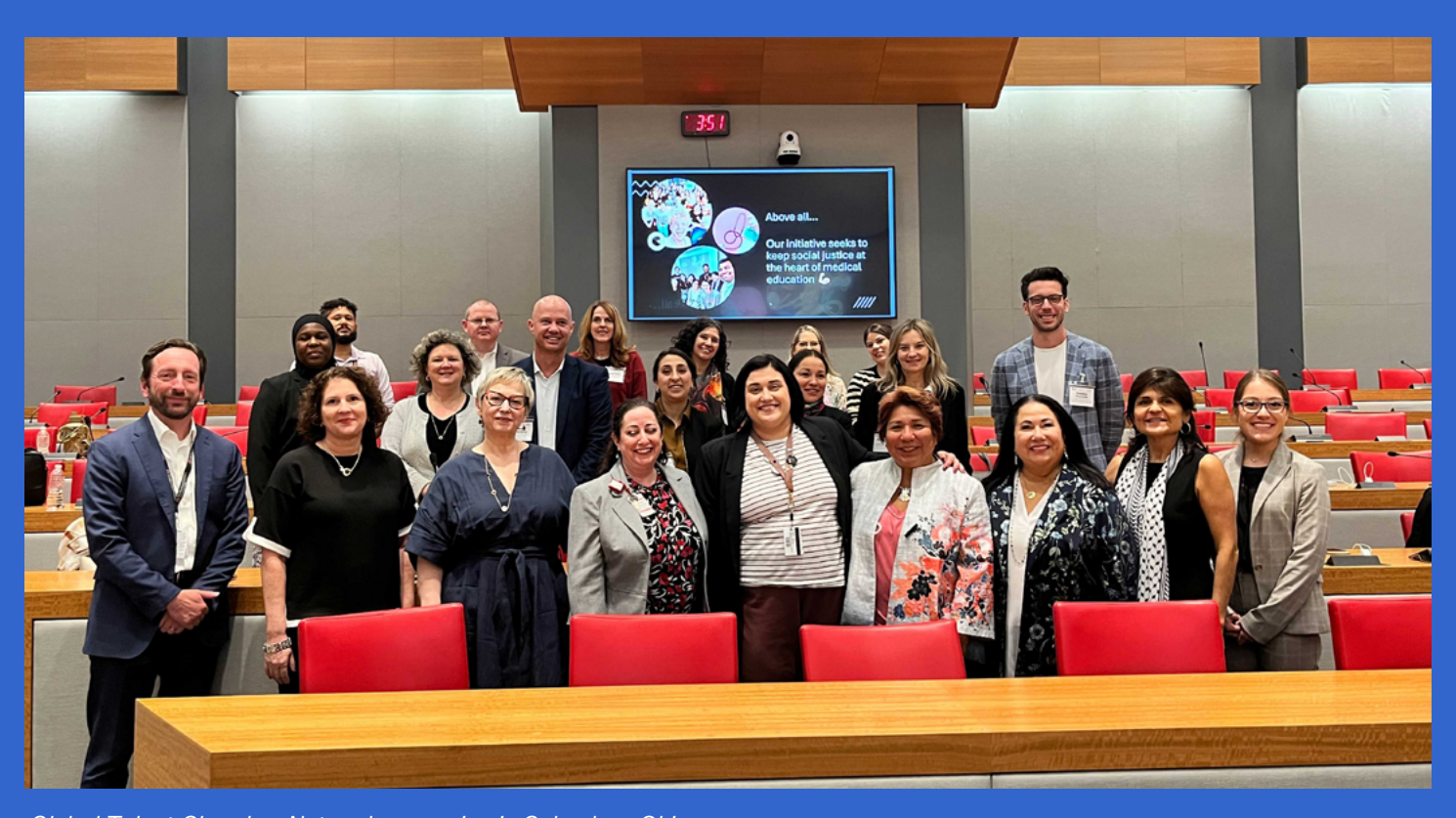
Global Talent Chamber Network convening in Columbus, Ohio

State and Local Initiatives, Cultural Exchange, and the Center for Inclusion and Belonging