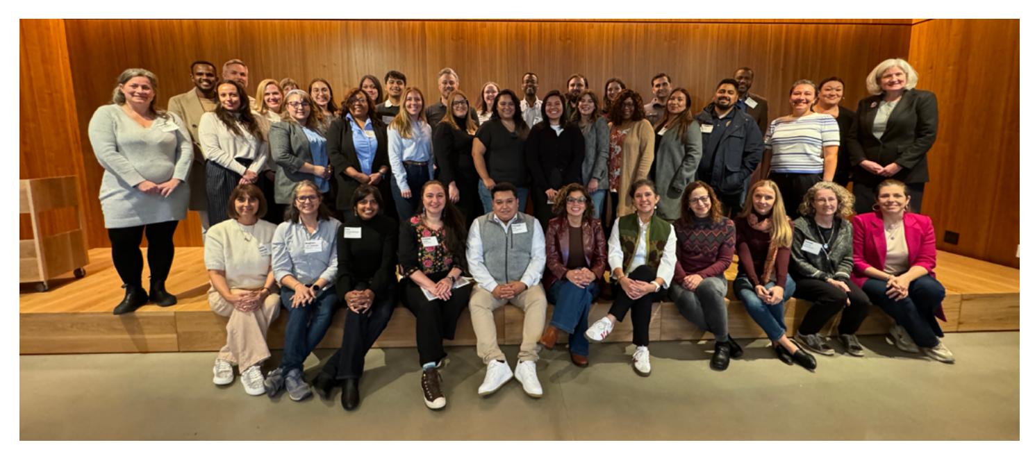
Office of New Americans (ONA) State Network convening in Washington, D.C.

In November, we held our annual ONA convening in Washington, D.C., where we celebrated the 10<sup>th</sup> anniversary of the network. The convening, our largest to date, took place just after the election, allowing ONAs to come together to plan for the incoming Trump administration and interface with federal partners. Nearly 40 representatives from 18 ONA states received a post-election briefing from the Council's Policy team and exit poll analysis of voter sentiments on immigration from the Immigration Hub. The convening concluded with a private meeting with highlevel federal officials from the White House, DHS, and U.S. Citizenship and Immigration Services, among others.