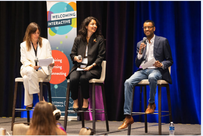
Top: Council staff at a Gateways for Growth convening Bottom: Welcoming Interactive in Dallas, Texas