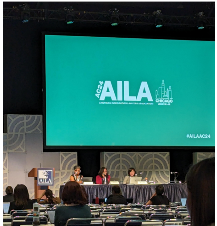
The Cultural Exchange team presenting at the AILA annual conference in Chicago

As we build the infrastructure for scale, we're excited to be building relationships to reach more people than ever before. More than 250 people have attended our educational sessions and webinars so far in 2024. We are also leveraging our partnership with the American Immigration Lawyers Association to help immigration lawyers better understand the opportunities and the requirements; we have hosted six private events, both virtually and in person, for chapters of the American Immigration Lawyers Association and legal firms.