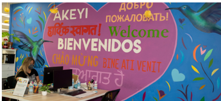
A mural in the migrant travel center operated by Jewish Family Service of San Diego.