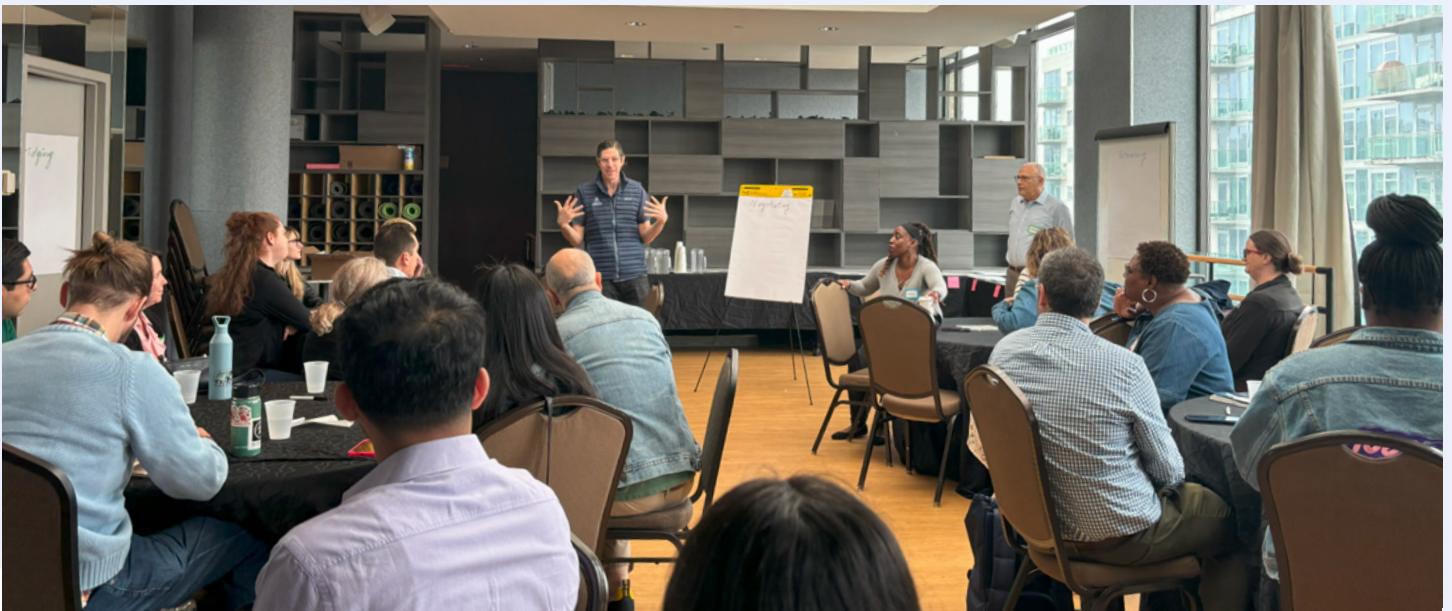
Council staff during a workshop at our team retreat in Queens, New York

We have also started to design our brand video project, which will introduce people to our work in a way that speaks to the heart. The video, which will launch alongside our new website, will highlight interviews with our partners and directly impacted immigrants and refugees to make the emotional connection between the work we do and our audience. With all these branding updates, we aim to drive higher engagement and create a deeper connection to our mission, vision, and values.