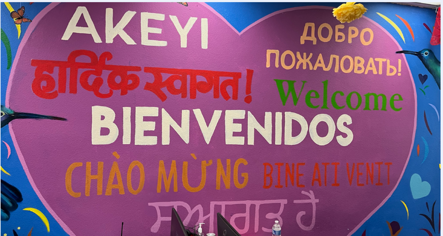
A mural in the migrant travel center operated by Jewish Family Service of San Diego.

State and Local Initiatives, Cultural Exchange, and the Center for Inclusion and Belonging