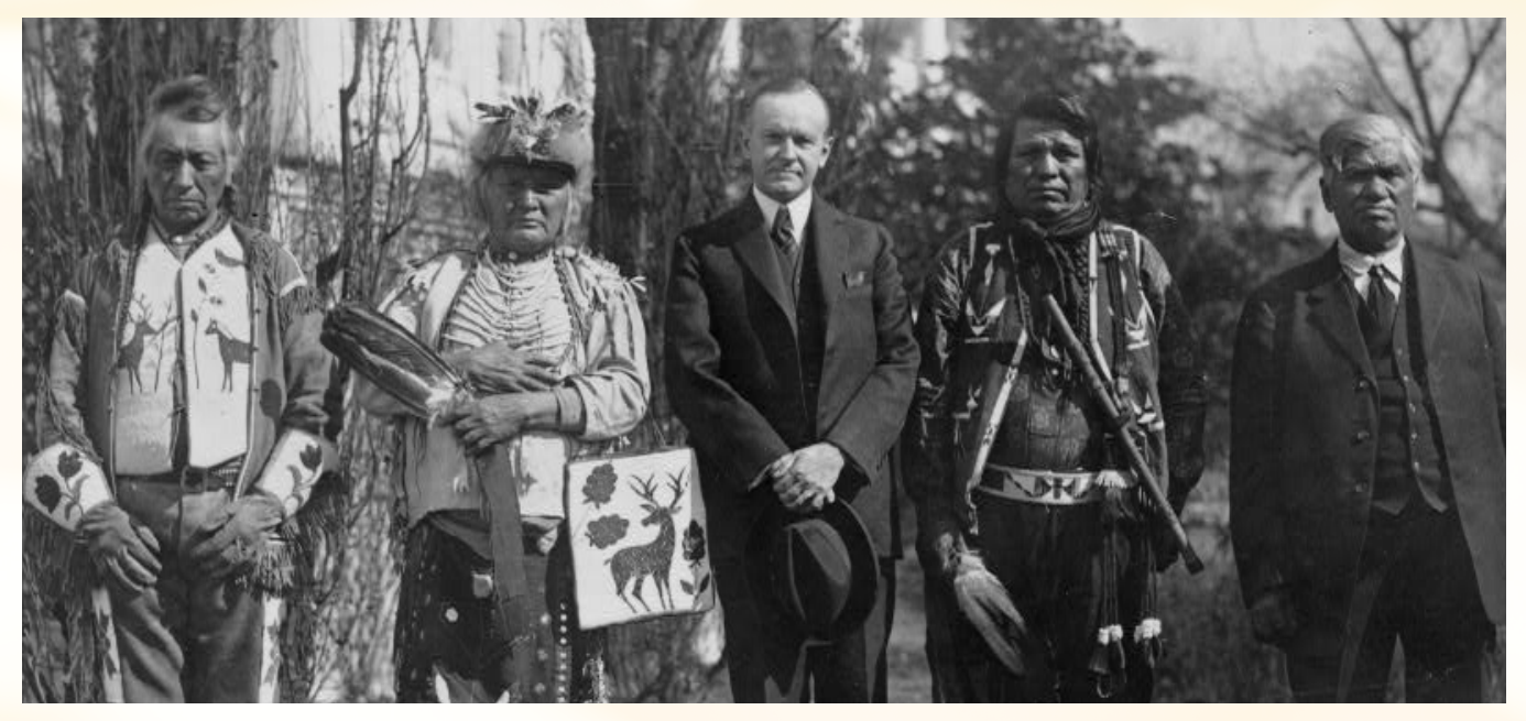
Calvin Coolidge First Administration, Herbert E. French, National Photo Company, v. 2, p. 41, no. 34318, National Photo Company Collection, Library of Congress

Through the 1924 Indian Citizenship Act, Congress granted citizenship to all Native Americans born within the territorial limits of the United States. <sup>40</sup> The new law meant that Native Americans were no longer required to shift allegiance from their tribe to the United States as the law recognized that such dual allegiance was not a conflict. <sup>41</sup>